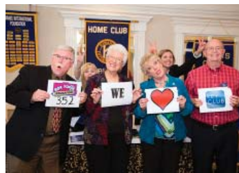
Our club accepts the Key Club's challenge to see which organization can collect the most Box Tops for Education.