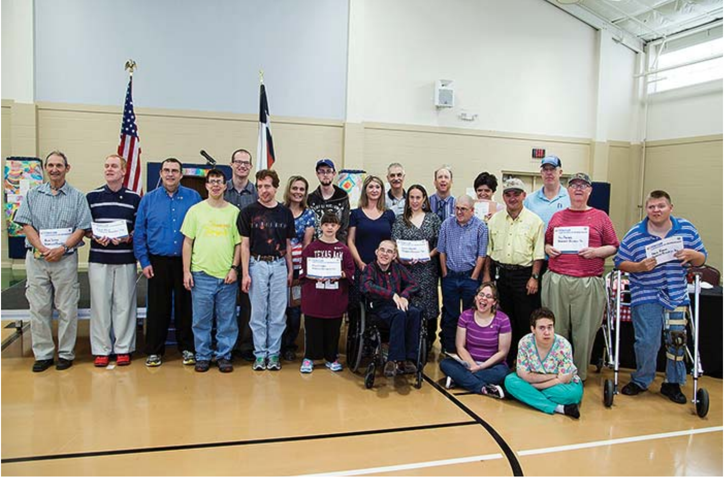
DRI Aktion Club