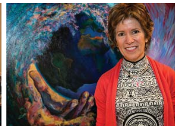
Latimer Bowen painted a picture of the Lion of Judah as the Dowdys sang.