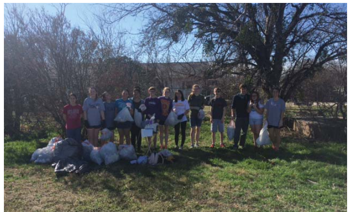
Key club picked up trash at north 12 and grape, why? Because a member drove by and thought someone should clean it! That someone was a group of key clubbers.