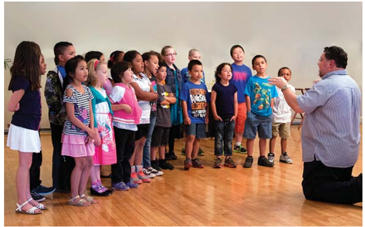
A group of 1st and 2nd graders presented a program of patriotic songs.