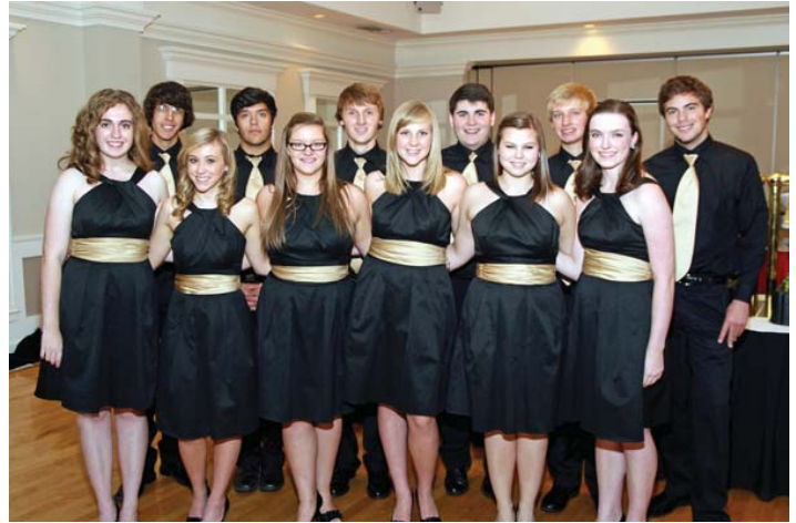
The musical group Pure Gold from Abilene High School presented the program.

Hendrick Hospice Volunteers are needed to help during the holiday season to work 2 hour shifts. This