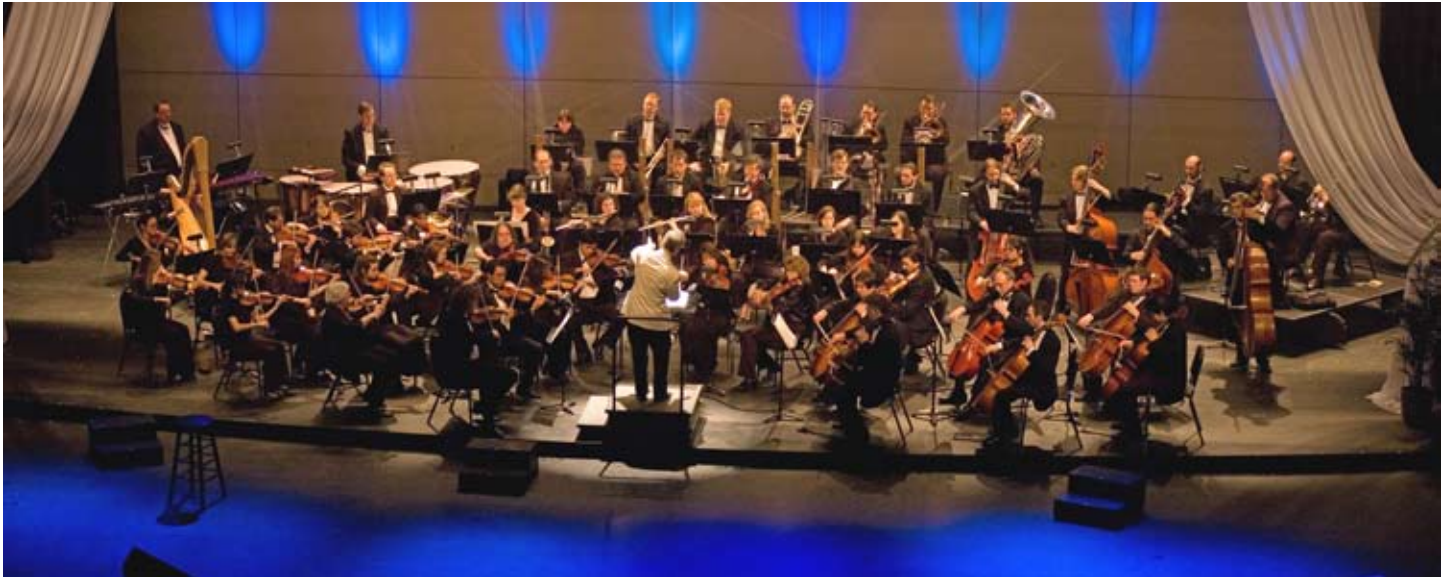
The Abilene Philharmonic season opens on Sept. 29 with "Masterworks #1," a classical concert.