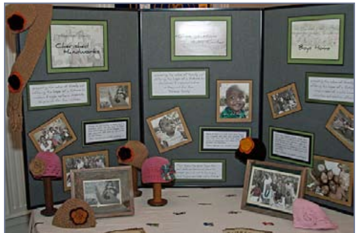
Cherished Handwork display