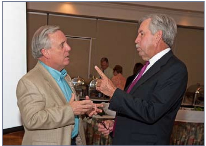
Mayor Normal Archibald and Senator Fraser discuss politics.

Russell Berry introduced State Senator Troy Fraser, an Abilene native as the speaker.