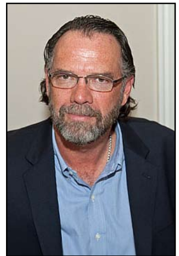
Local petroleum geologist was our guest speaker.