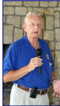
Top to bottom, left to right

We had a good turnout at Ben Richey Boys Ranch.