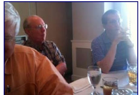
What's the chorus of 'I Saw The Light'?