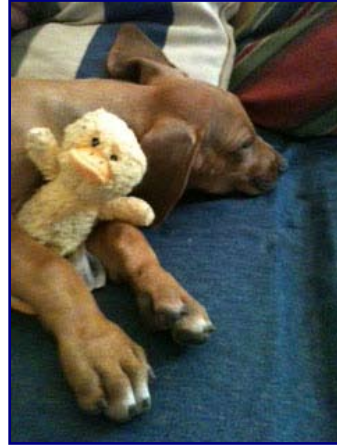
How did Maverick get here?