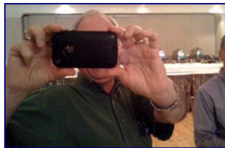
Who's behind the camera?