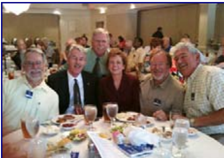
Who says Kiwanis isn't fun?