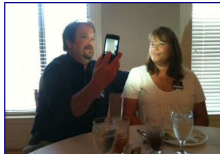
Maybe this can be our anniversary gift