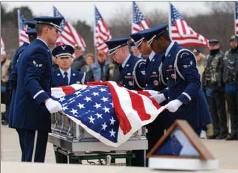
DALLAS — Honor Guard members from Dyess Air Force Base, Texas, drape the flag over a casket Jan. 14 during a funeral ceremony at the Dallas-Fort Worth National Cemetery.

Wed., May 18, 2011, Noon @ Abilene Country Club