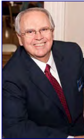
President-elect Charles Kirkpatrick led the Pancake Day Kickoff program.