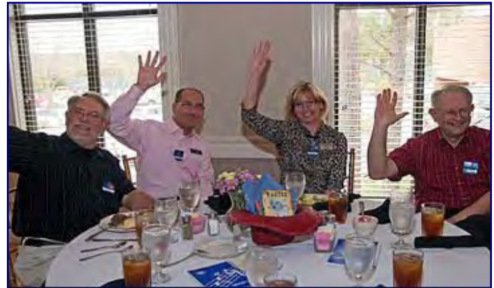
How many of you are under the age of 62? or How many of you will sell a lot of Pancake tickets?