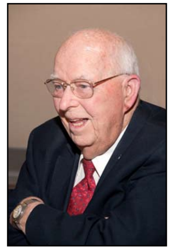
Clockwise from top, members of the Fort Worth Kiwanis Club, the club that helped found our club 90 years ago, presented a congratulatory card signed by all its member.