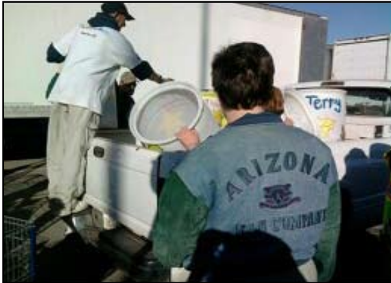
The Aktion Club delivered 8 nearly full barrels of donations to Mission Thanksgiving.