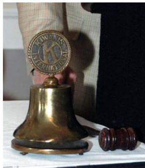
Ringing the Bell