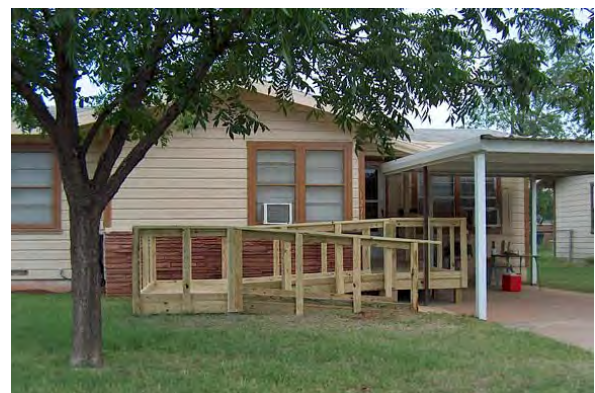
Before and after - The finished product!