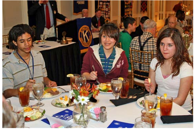
Left to Right: Twenty-five students from Cooper attended our meeting. A group of students from Cooper High School enjoying a good lunch